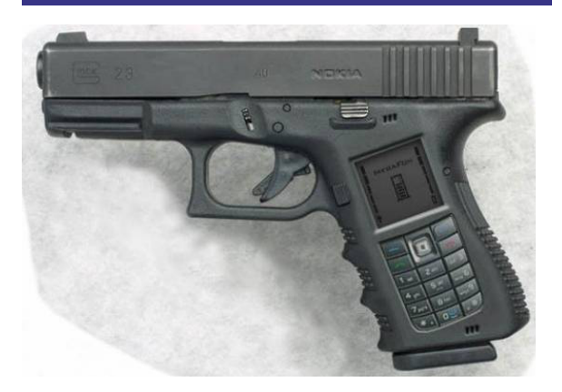
Good for "shooting the bull?